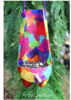
Recycled Bird Feeder For Kids

Recycled Bottle Birdfeeder: Create a unique birdfeeder out of a recycled two-liter soda bottle. Decorate the bottle with tissue paper and Mod Podge. Ages 6-12. Registration is required.